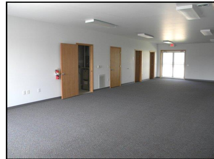
Vanilla Shell Available