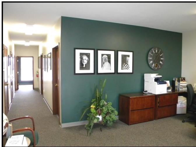
Existing Tenant Build Out